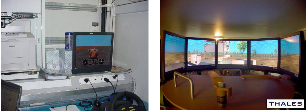
Figure 2 - CPT Driver Station (left), CPT Out Of Turret Display (right).

the management of the Source Selection process. More information regarding this project may be found on the Defence website.